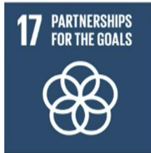
SDG17: Partnerships For The Goals