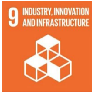
SDG9: Industry, Innovation & Infrastructure