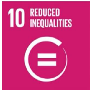
SDG10: Reduced Inequalities