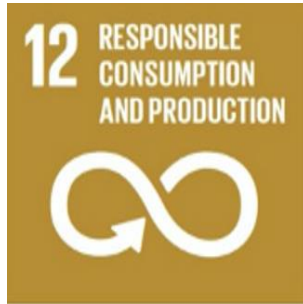
SDG12: Responsible Consumption & Production