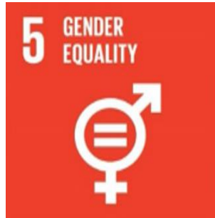
SDG5: Gender Equality