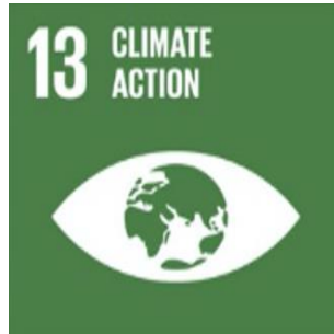
SDG13: Climate Action