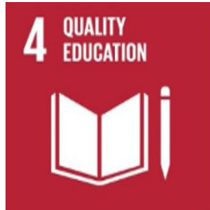
SDG1: No Poverty