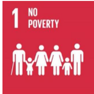
SDG1: No Poverty