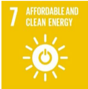
SDG7: Affordable & Clean Energy